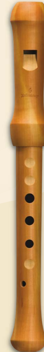
Penta in d'' pentatonic

Thanks to the special shape of its windway, the Bäumling model features an especially tender, delicate sound.