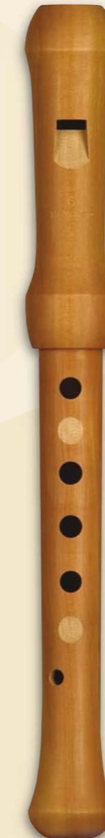
Penta in d'' seven-tonic