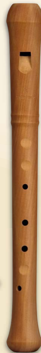
Bäumling in d'' pentatonic