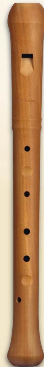
Bäumling in d'' seven-tonic