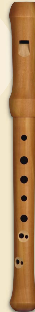
Soprano in c''